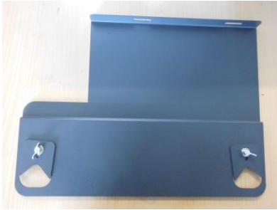
Ground Plate Unwinder