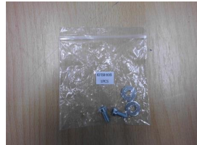
1 Set with screws