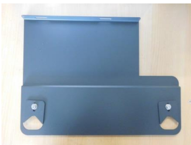
Ground Plate Rewinder